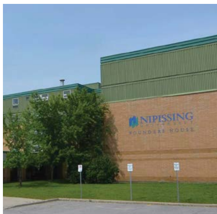
Founders House 1 College Dr. North Bay, ON