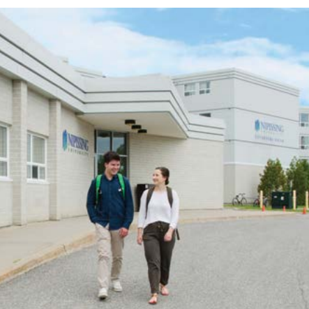
Governors House 100 College Dr. North Bay, ON