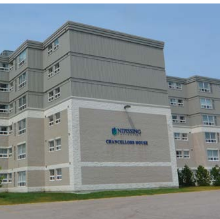
Chancellors House 900 Gormanville Rd. North Bay, ON