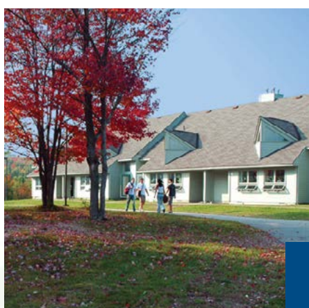
Townhouse Residence Complex 100 College Dr. North Bay, ON

For more information about delivery & mailing addresses, see page 16